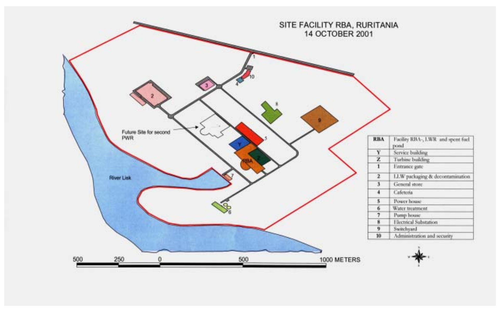
Figure 2: RBA Site Map (Attachment to Declaration No. 4)